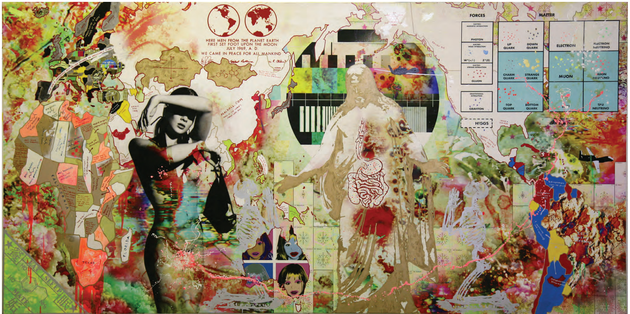
'BEYOND THE GRAVITY OF THE ARTIFICIAL' MIXED MEDIA - 140 x 280 cm