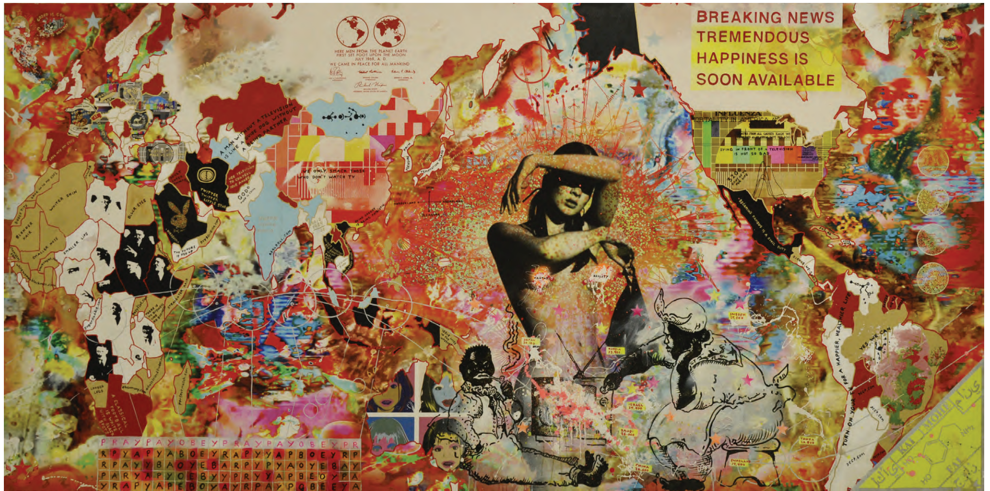
'CONTROL BY PLEASURE VS. CONTROL BY PAIN' 1 MIXED MEDIA ON CANVAS - 280 x 140 cm 0